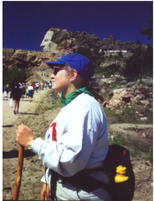
Does she have the nose?

Arriving in Cheyenne late in the afternoon, we decided to take the capital city year round event that evening. We passed the capital and the statue of the cowboy on the bucking bronco (the one that is shown on all WY license plates.) We hurried past historic homes and cemeteries because ominous, tornado-producing clouds hung loosely overhead. To our relief none materialized. This city is the main hub for the Union Pacific Railroad and the lonesome whistle of many trains blared as they rumbled through the town.